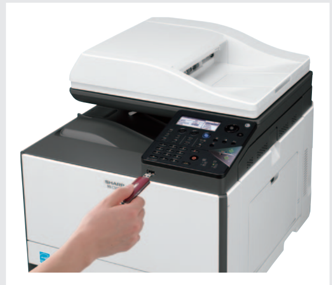
FRONT ACCESS USB PORT

Both models are equipped with a handy USB port for walk-up printing and scanning with a memory stick. And if you choose the MX-C300W, you can connect it to a wireless network and print wirelessly from your smartphone or tablet.