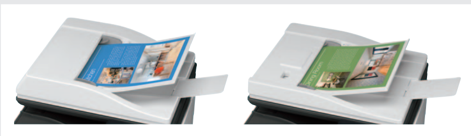
CHOICE OF DOCUMENT FEEDERS